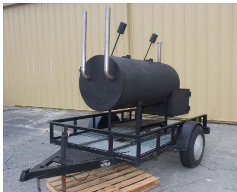
The grill has its own travel trailer.