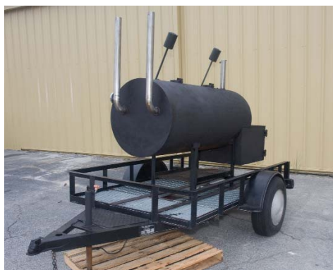
The grill has its own travel trailer.