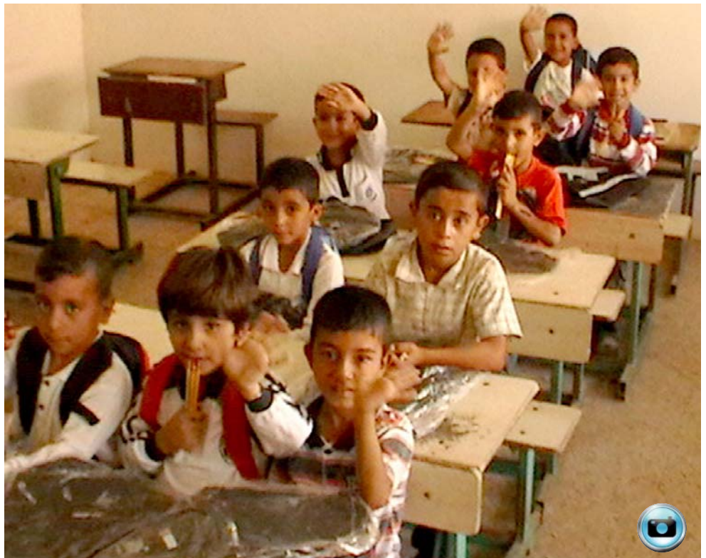
In October the Iraqi children received the pencil and paper supplies which were gifts of the congregation of Christ Episcopal Church.

Oct. We plan to deliver some more supplies to a school that is in a poor neighborhood. The students and teachers were overwhelmed with the generosity that they received. I am hoping to have an article placed in the Valdosta Daily Times about your contribution. The Public Affairs Office wrote an article on the school's opening, and I was interviewed and mentioned the project. I have pictures that I am attaching to this e-mail. You can send what you currently have on hand. I am trying to find a point of contact to continue with the project. I will be leaving my current location in late November. After that time I will be unable to receive or distribute any