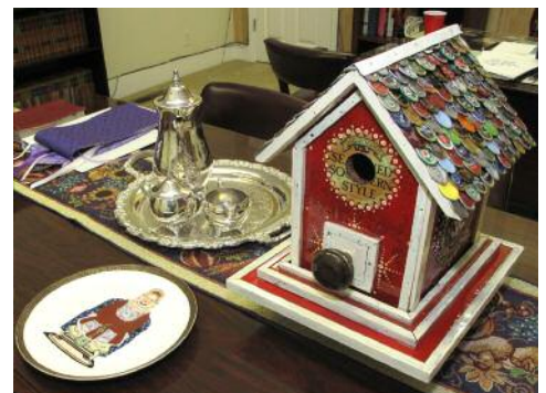
Pictured at right are three of the items up for bid at the silent auction.

The Silent Auction will begin Wednesday evening, May 11 after the 6 p.m. service and conclude on Sunday, May 15 after the 11:30 a.m. service.